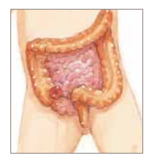
An ileostomy is a surgically created opening in the ileum or small intestine.