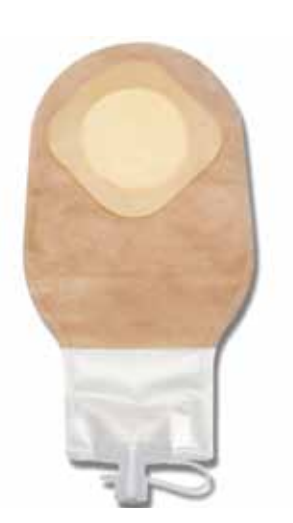
Urostomy pouching systems have a spout at the bottom to drain liquid or urine