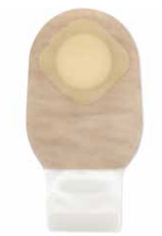
Drainable pouching systems can be used to empty stool and gas